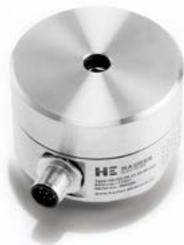
Series HE2XX with M12 connector