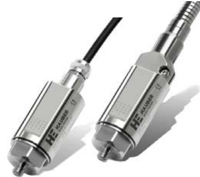
Series HE10X with integrated cable and flexible metal tubing (optional)