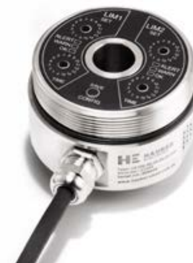
Series HE2XX (opened) with cable